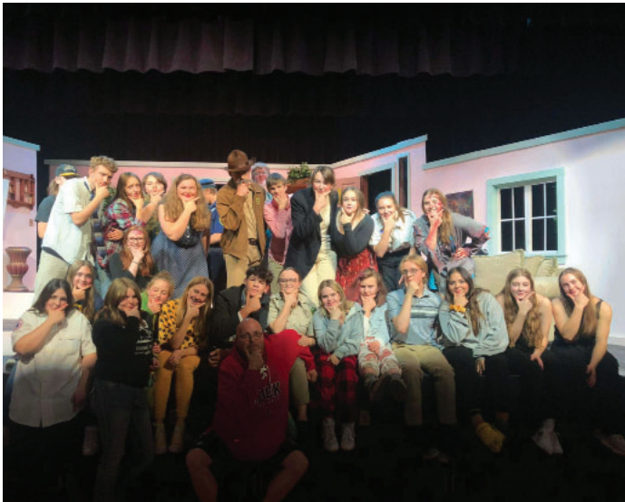
The cast after the show, feeling lovely.