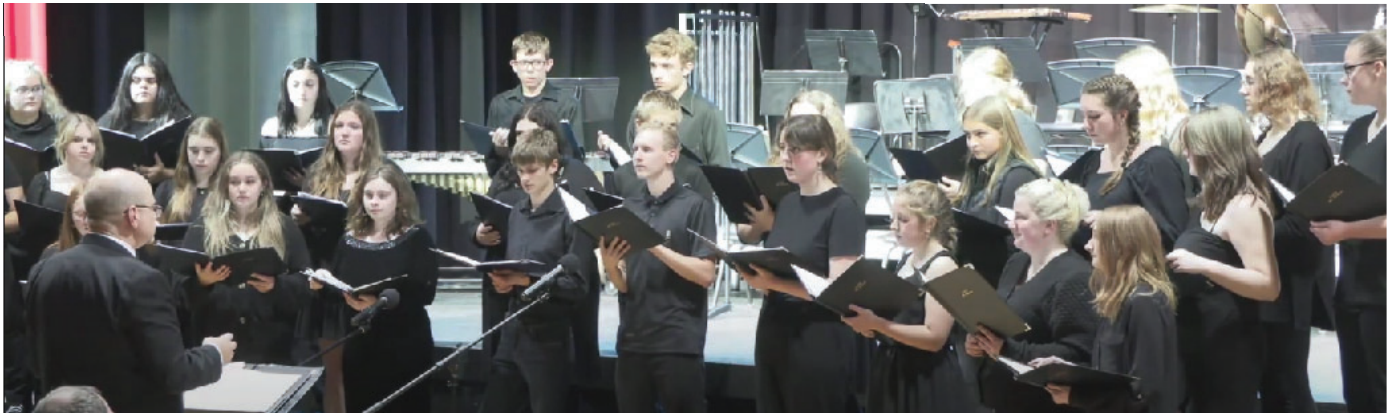
High School Choir