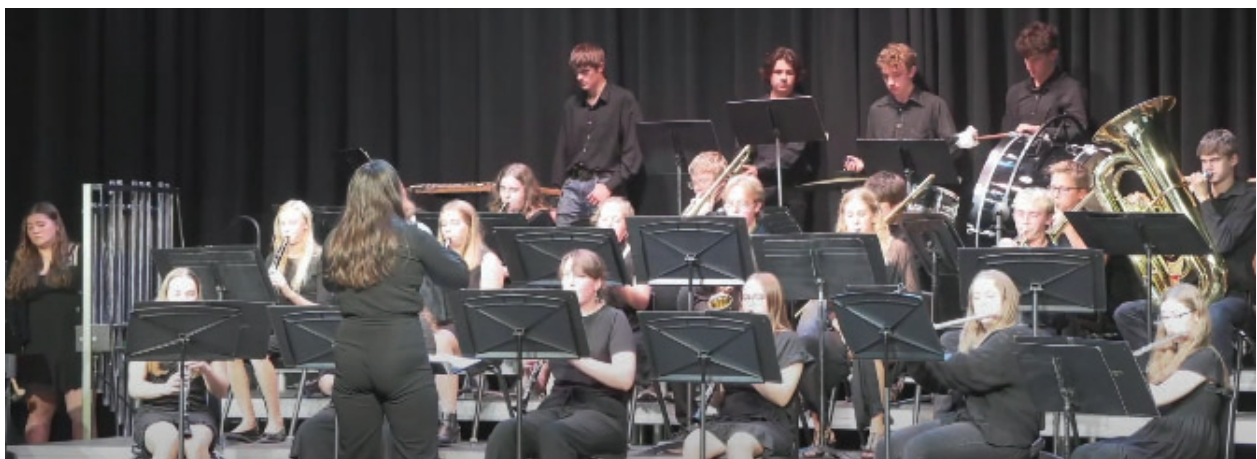
High School Band