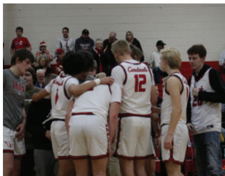
The team huddled up for a timeout