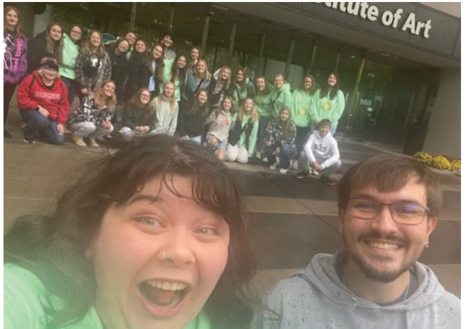
The VAC Club and the Spanish Club taking a selfie by the Institute of Art.

The Spanish Club and the VAC Club went on a field trip on October 13, 2023. The clubs went to the Minneapolis Institute of Art and to the Midtown Global Market. Students explored the Institute and found many cool things like paintings, sculptures, and photography. Students and the staff then ate at an authentic Mexican restaurant called Salsa a la Salsa. Some courageous students even tried cooked cactus! The club members also explored some of the unique shops at the Global Market. Some students found cool souvenirs like Tibetan scarves and Ugandan earrings. A few of the club members got to also try authentic Japanese boba! The Spanish Club also made guacamole for the 8th grade's Festival of Nations event. The students made fresh guacamole by combining peppers, jalapenos, avocados, garlic, onions, and tomatoes. A few members of the club even spoke to the 8th grade class about the history of guacamole. It was perfect!