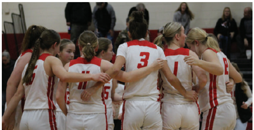
The varsity team huddled up before the game.