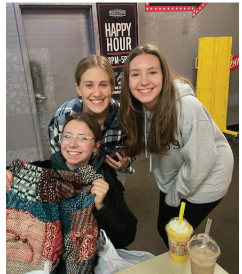
Some of the students at the Global Market.