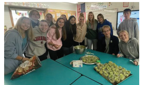
The Spanish Club after making their guacamole.