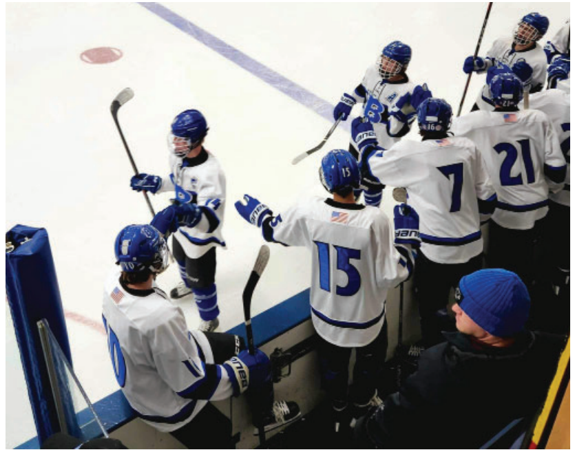
The Blizzards getting pumped up.

November 28 vs Chequamagon, Phillips, Butternut 11-0 W December 1 vs Altoona 1-7 L December 5 vs Barron 7-6 W December 7 vs Moose Lake 2-3 L December 8 vs Black River Falls 0-2 L December 11 vs Mora 2-3 L December 15 vs Ely 2-8 L December 16 vs Stevens Point Pacelli 1-3 L December 19 vs Medford 2-1 W December 21 vs Ashland 3-2 W December 27 vs Northwest Iceman 7-1 W January 6 vs Stevens Point 3-2 W January 9 vs Spooner Rails 5-2 W