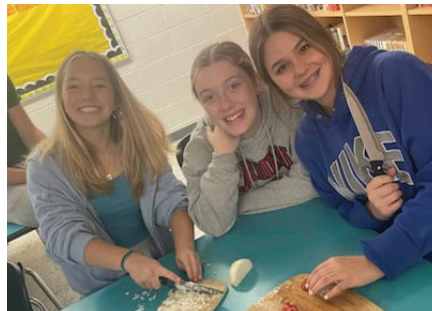
A few of the members cutting tomatoes for the guacamole.